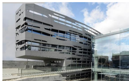
ABDOUN FASHION ATRIUM, AMMAN (JORDAN) SYMBIOSIS DESIGNS LTD ARCHITECTURE FIRM