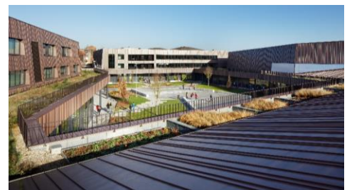
MOULINS HIGH SCHOOL, LILLE (FRANCE) CHARTIER DALIX ARCHITECTES ARCHITECTURE FIRM IN COLLABORATION WITH AVANTPROPOS ARCHITECTS PHOTO VMZINC © CHARTIER DALIX ARCHITECTS PHOTO T. SHIMMURA

VISUALS AND FOCUS ON ZINC AVAILABLE ON REQUEST FROM THE PRESS SERVICE OR VMZINC CONTACT.