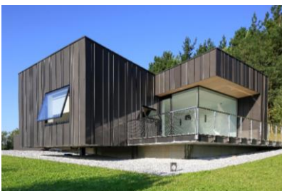
CASA GOLF, HONDARRIBIA (SPAIN) REHABITE ARCHITECTURE FIRM

Thirteen years after its creation, enthusiasm for this architecture competition has not waned. This is demonstrated by the latest edition which received over 150 projects from 18 different countries. The Jury, made up of international architecture and construction experts, awarded 9 Prizes in the following categories: Individual Housing, Collective Housing, Commercial Buildings and Public Buildings, as well as three Special Prizes (Sustainable Building, Internet Users' Prize and the Grand Jury's Prize) . Beyond the buildings themselves, the jury awarded prizes to overall projects combining architectural quality, successful integration into the environment, creative use of zinc and functionality of the buildings.