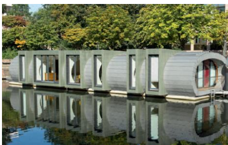
Barge, Hamburg (Germany) Architect: Daniel Wickersheim

All the projects are presented over two or four pages, with beautiful illustrations and detailed explanations on the specific use of zinc. With 50,000 copies published, FOCUS ON ZINC N°15 is translated from French into 5 languages** and is available on request from the VMZINC** teams. For those of you wishing to delve into the details of each building, a web magazine is available on www.vmzincforarchitecture.com .