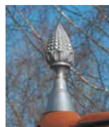
Delivered with fixing long screw.